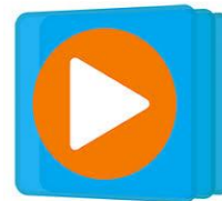
Window Media Player